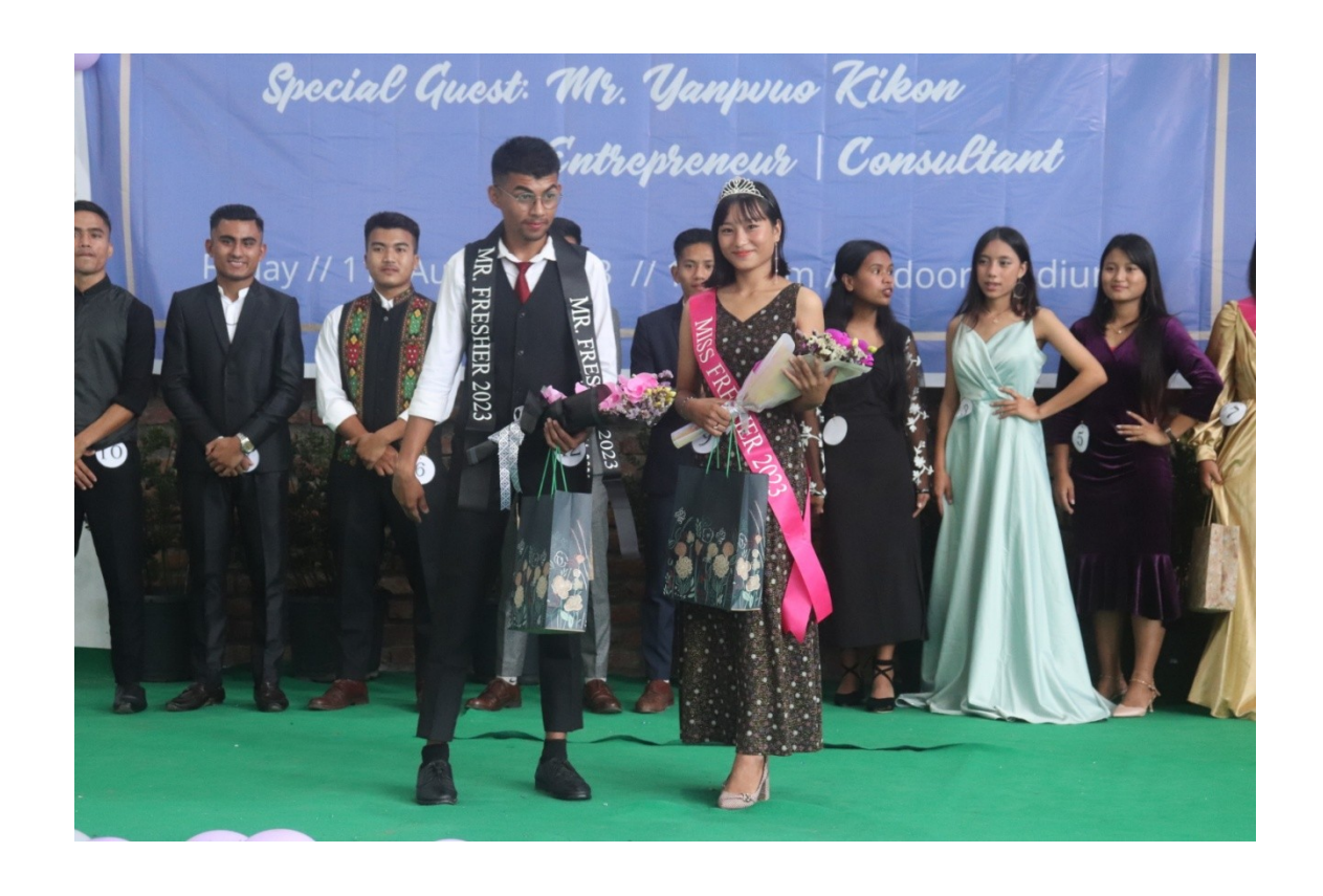
MR. & MISS FRESHER MODERN COLLEGE, 2023