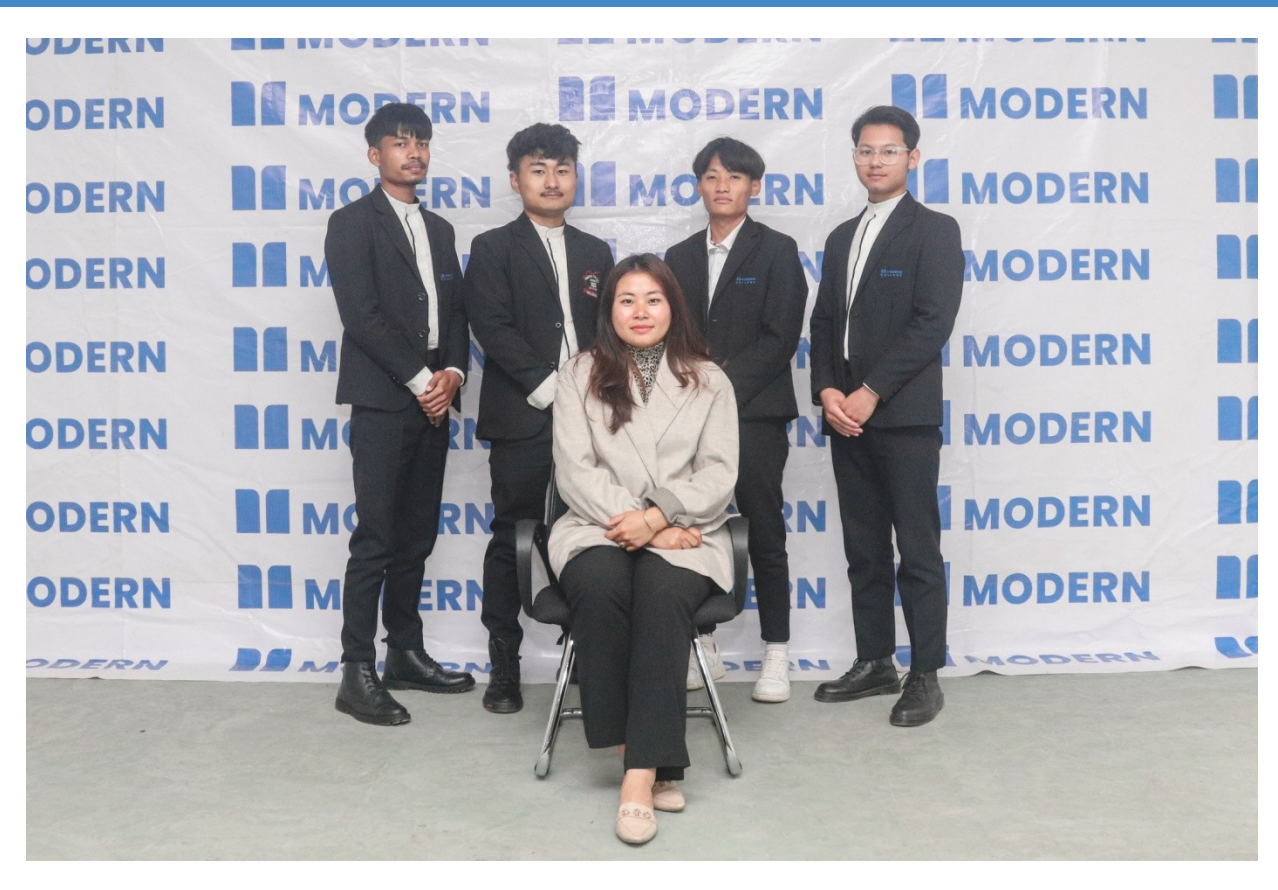
B. Voc. 2<sup>nd</sup> Semester