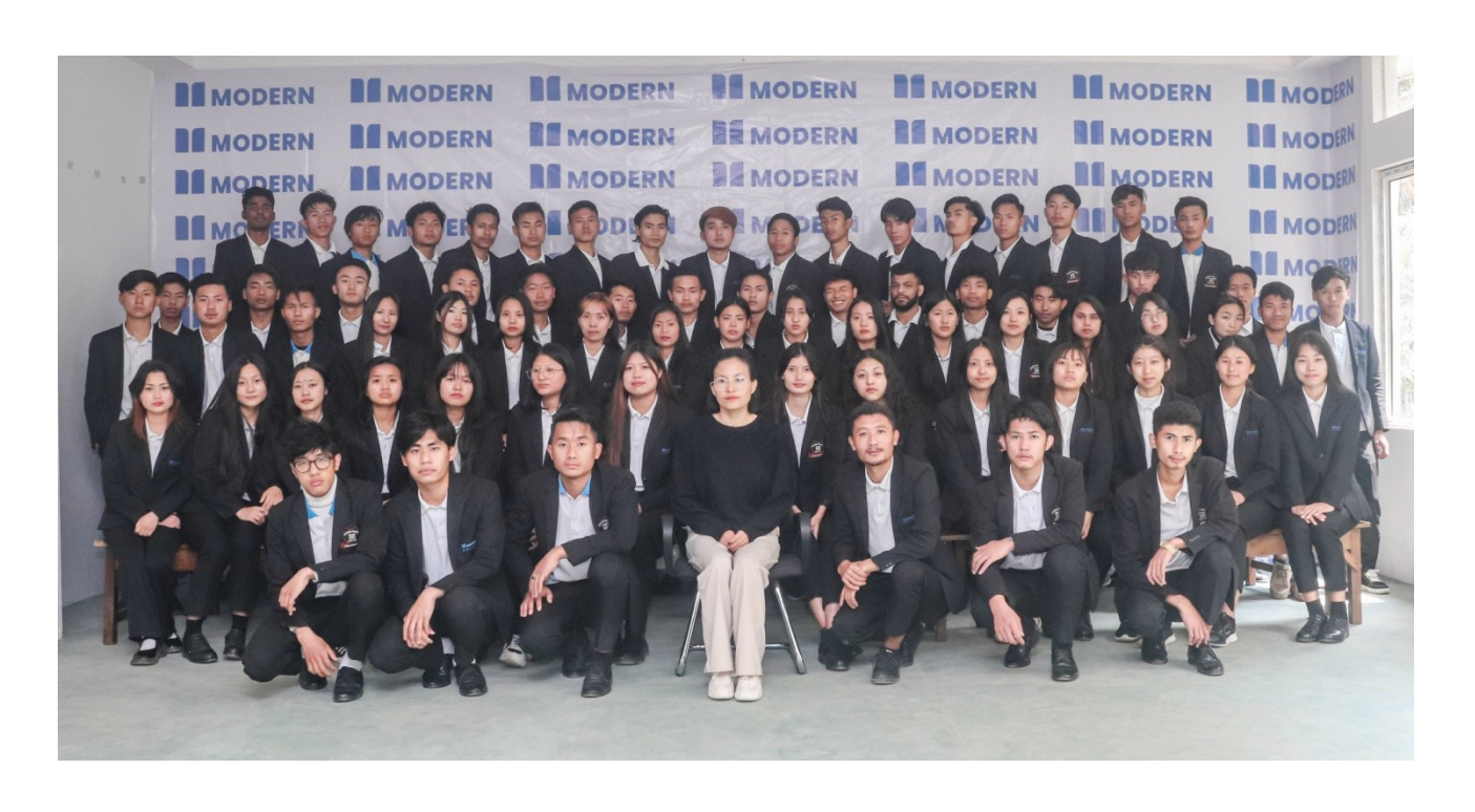
B.A. 2<sup>nd</sup> Semester (Honours)