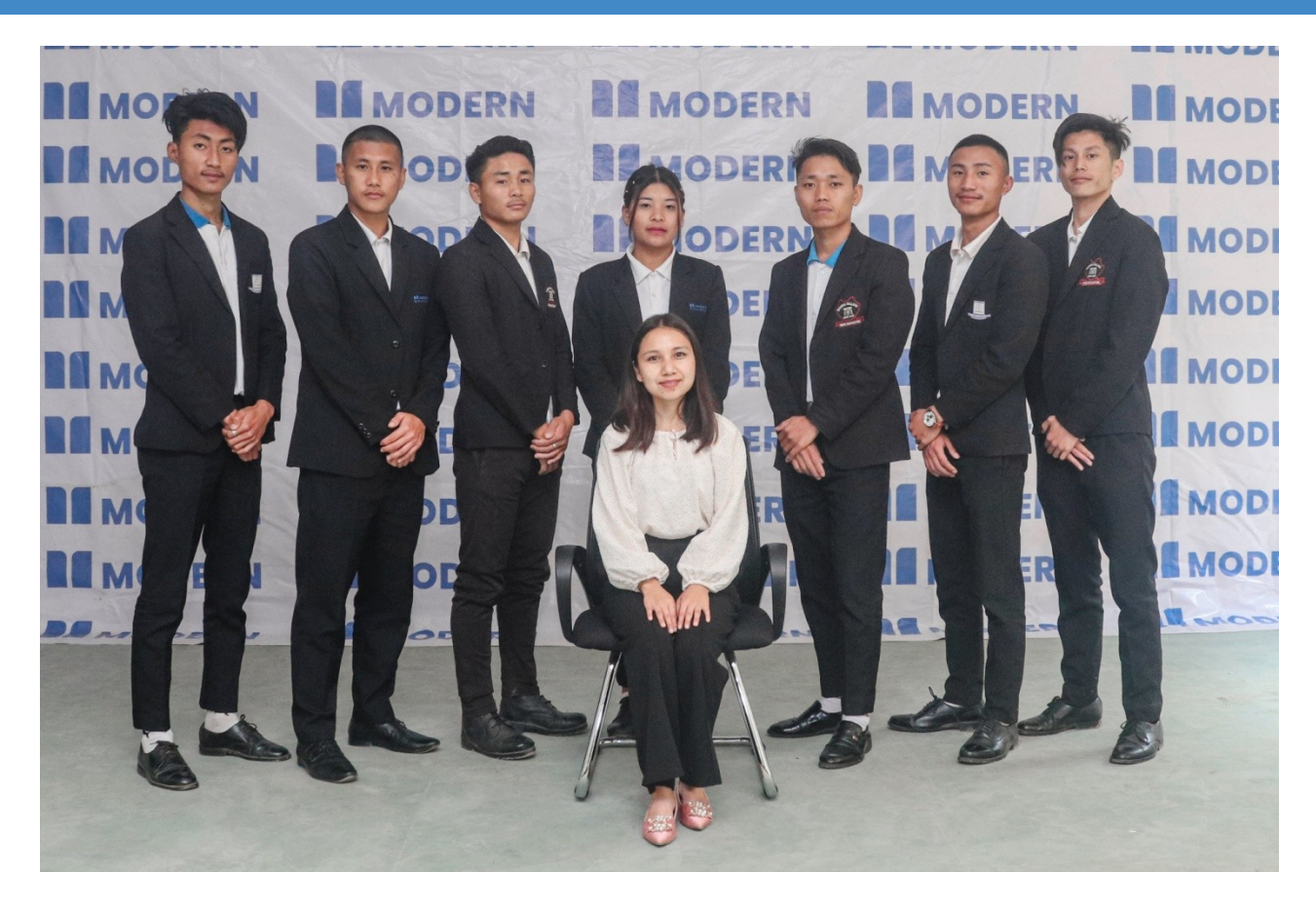
B.A. 2<sup>nd</sup> Semester (General)