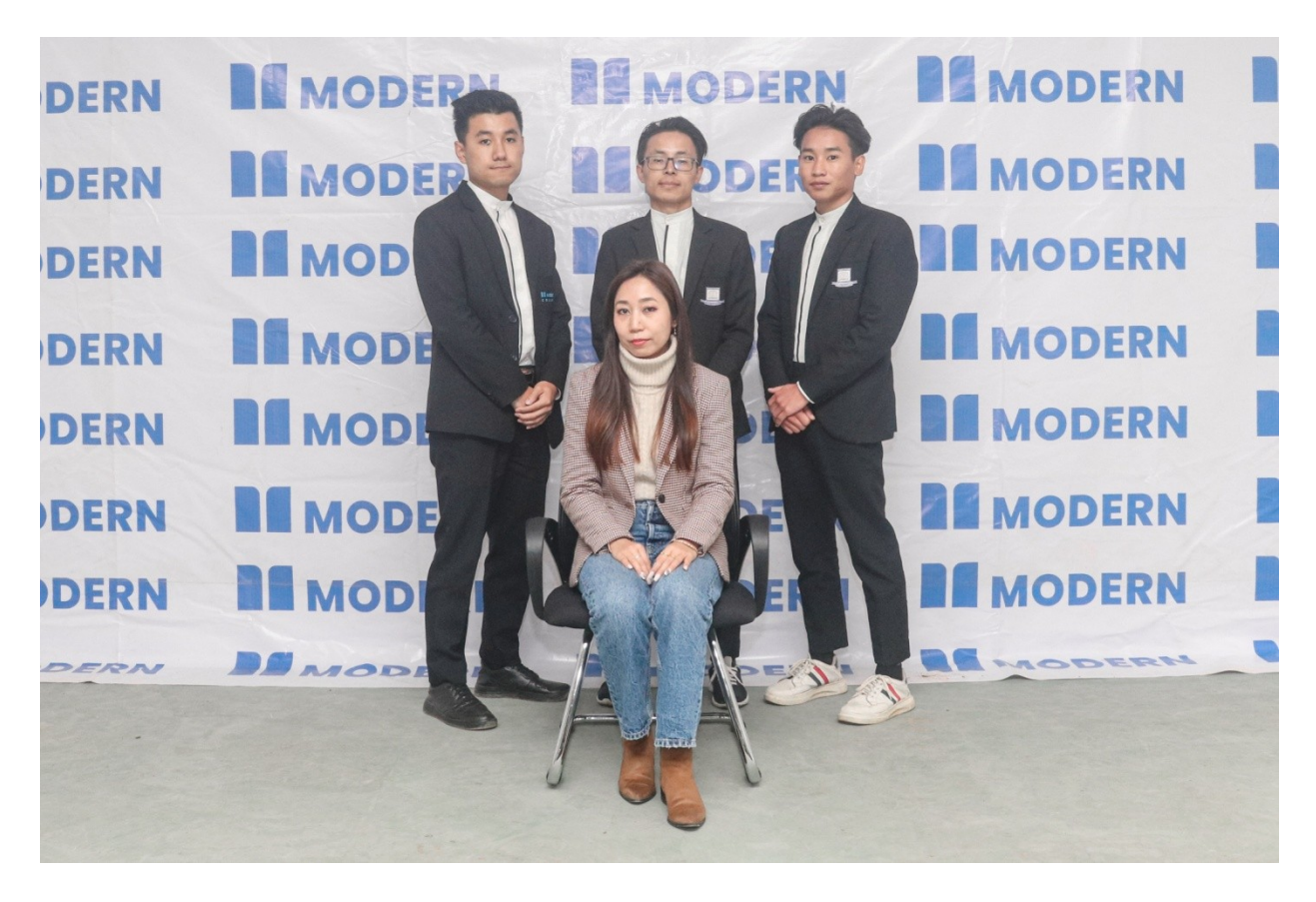
B. Voc. 4th Semester