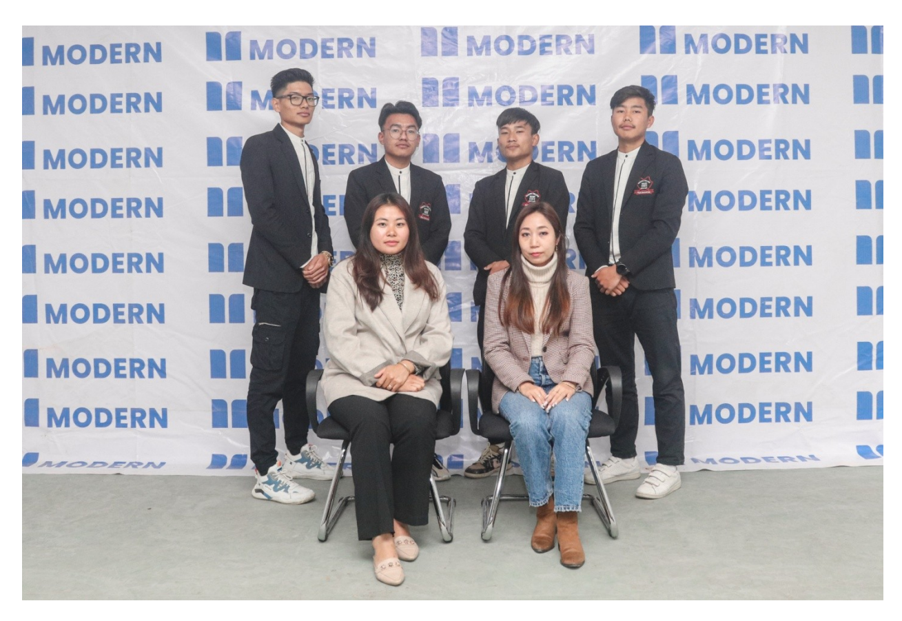
B. Voc. 6<sup>th</sup> Semester