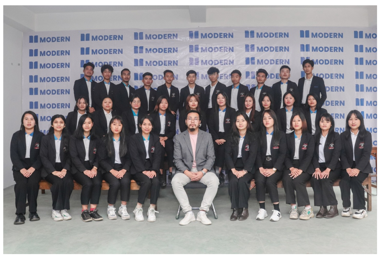
B.A. 6<sup>th</sup> Semester(Honours)