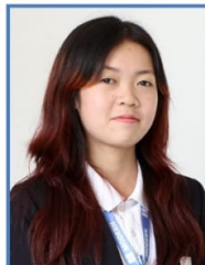
TIAJUNGLA RANK 2 (CGPA 6.96) EDUCATION