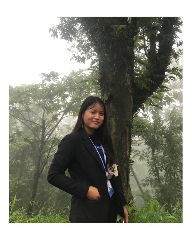
CHRISTMAS : A time for joy, giving and togetherness

As winter sets in and decorations adorn every corner, Christmas season is here once again. It is the most awaited time of the year and people all over the world are filled with excitement, joy and sense togetherness. Christmas is a time for families and friends to come together and create lasting memories. The cosy feeling of sitting near the fireplace with warm drinks brings back nostalgic memories.